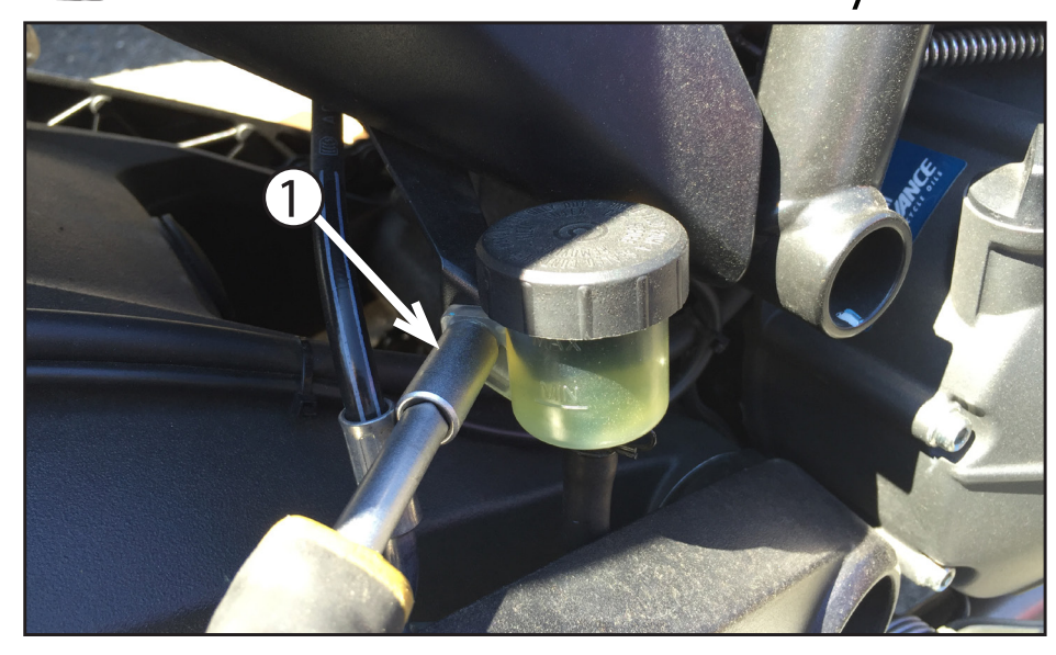
(1) Use an 8mm socket to remove the OEM M6 hex bolt. You will not reuse this bolt.