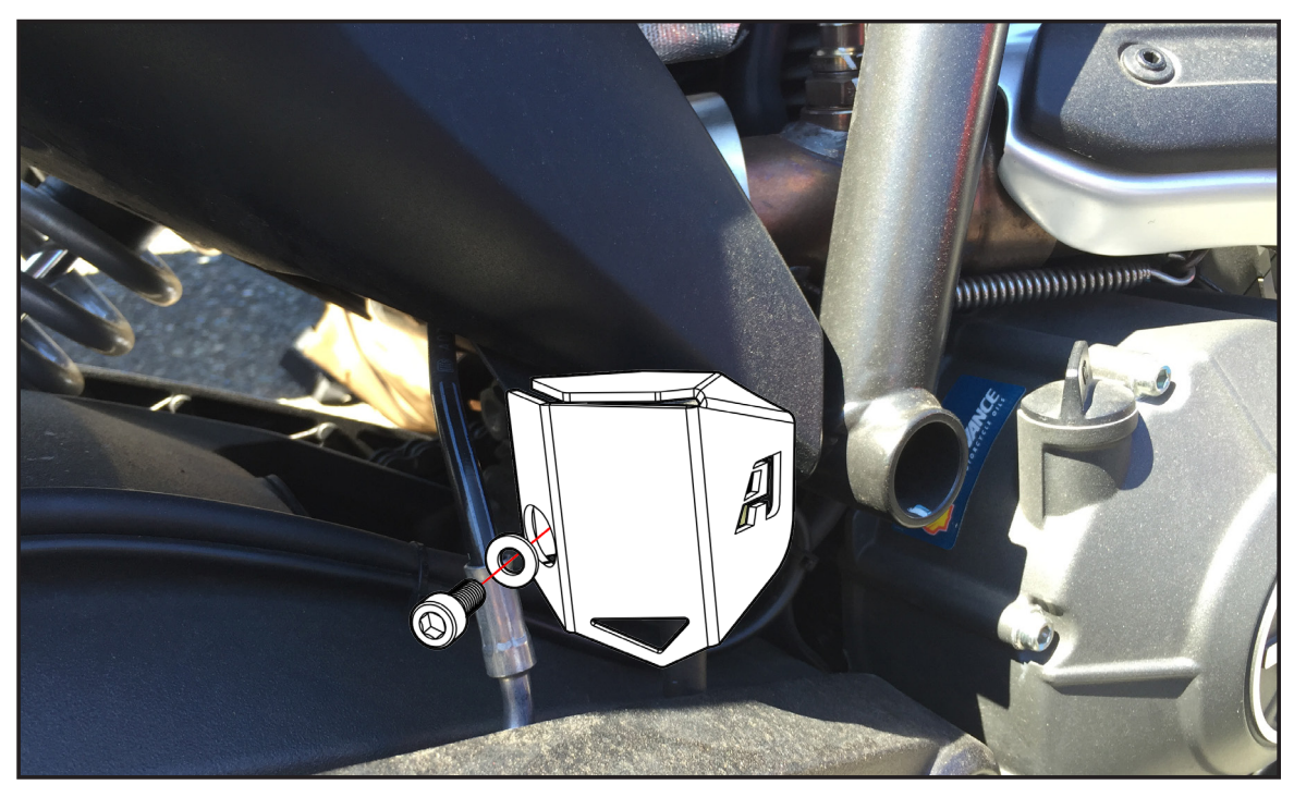
Using a 5mm allen tool, follow the assembly order shown above and attach the reservoir guard as shown. Tighten the provided M6 down (to 4nm) and you are finished.