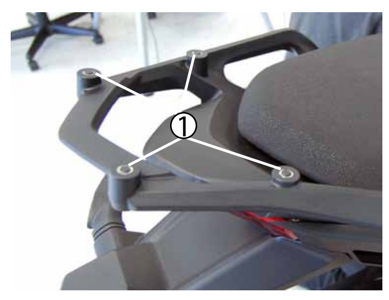
(1) Remove the (4) plastic plugs indicated above.