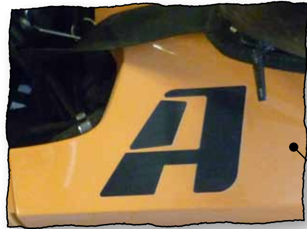
2.5" A-logo Decal