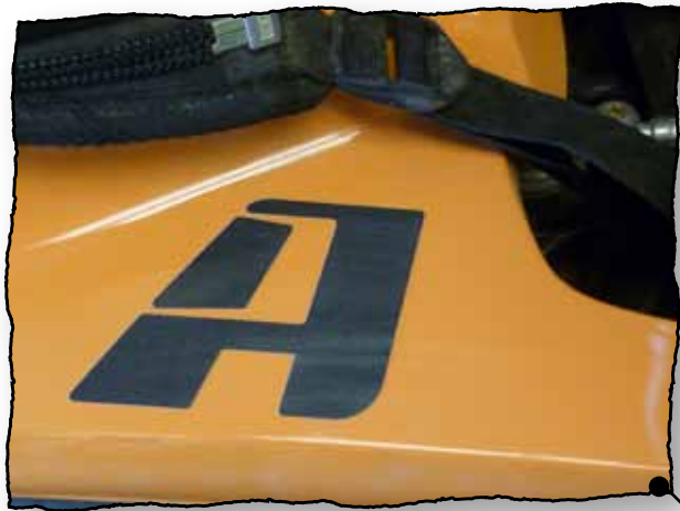
2.5" A-logo Decal