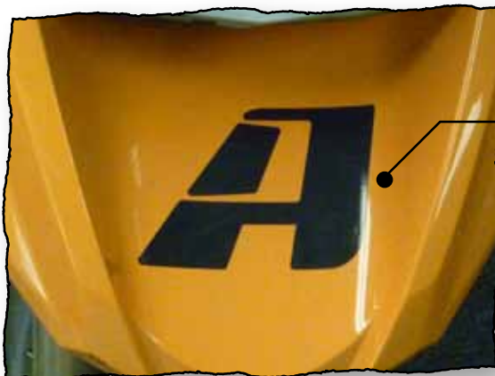
3.75" A-logo Decal