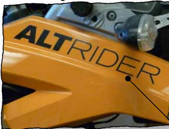
8.5" Altrider Decal