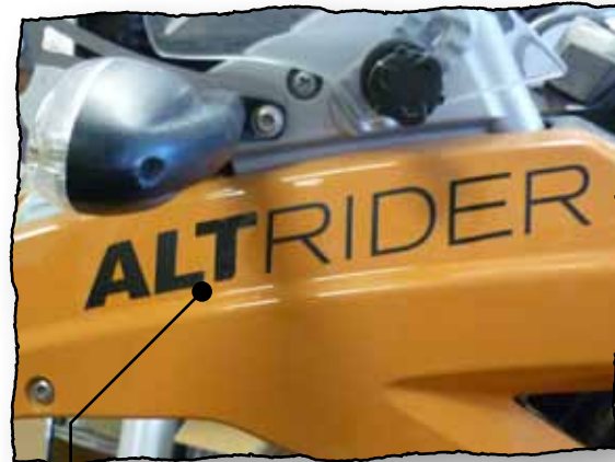
8.5" Altrider Decal